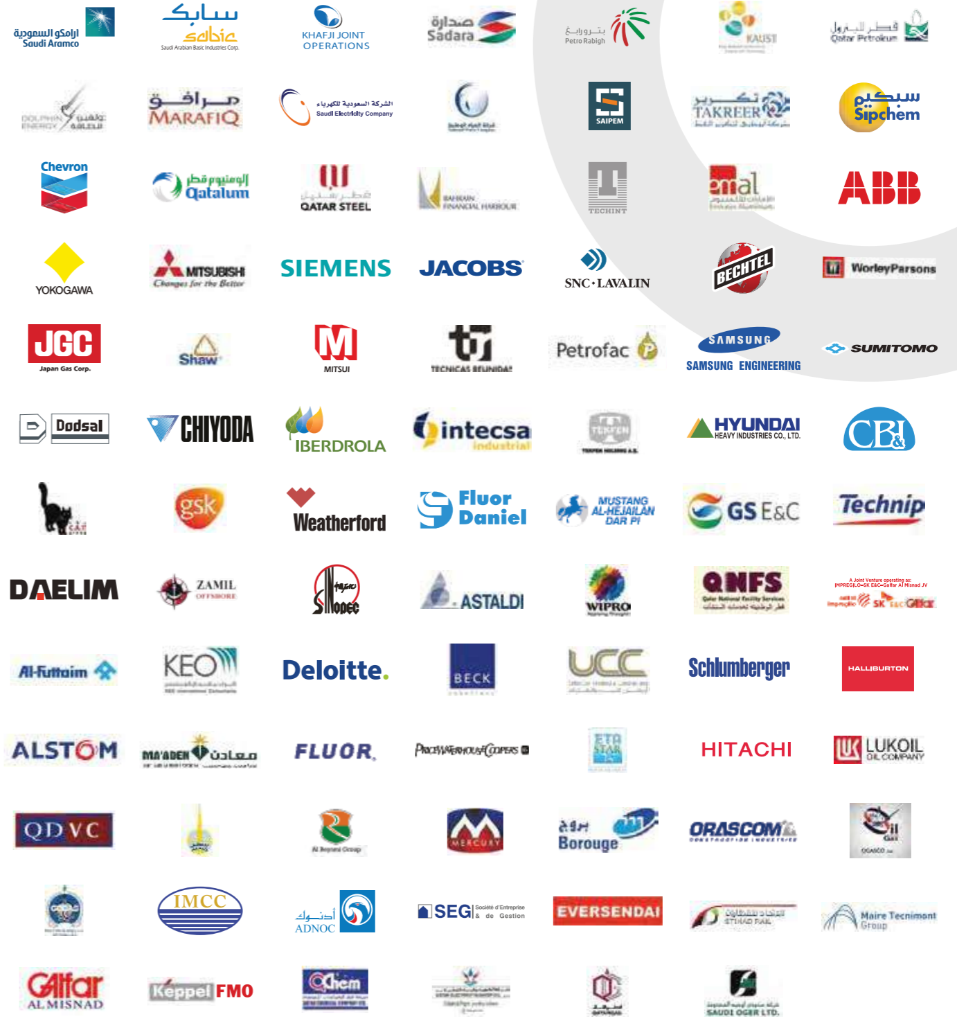
All logos are trademarks of the respective owners.

Our success lies on the uniqueness of deep rooted relations with clients & principal suppliers. We call them partners.